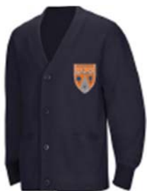
Item No. AG56424