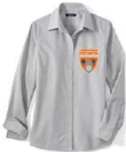
Item No. AG57654