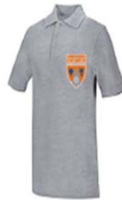
Item No. AG58914