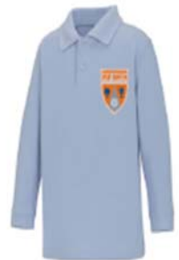
Item No. AG58914