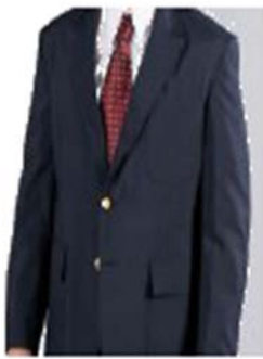
Item No. AG3008

(Shirts must be tucked in at all times; logos must be smaller than a quarter)