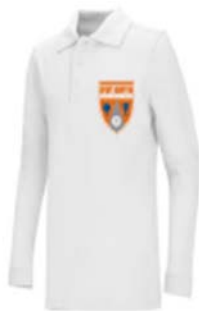
Item No. AG58914