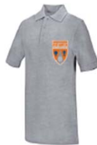
Item No. AG58914