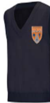
Item No. AG56914