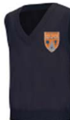
Item No. AG56914