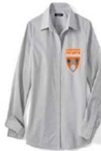
Item No. AG57654