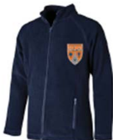
Item No. AG59204