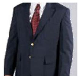
Item No. AG3008