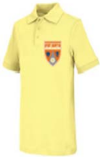
Item No. AG58914