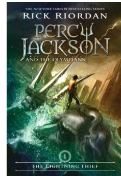
Percy Jackson and the Lightning Thief by Rick Riordan