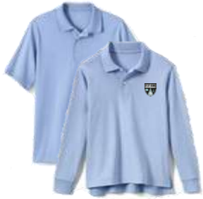
Light Blue Polo Shirt