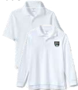
White Polo Shirt