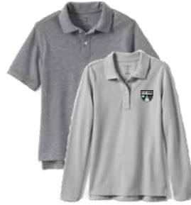
Grey Polo Shirt