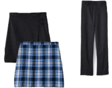
Black Pants, Black or Plaid Skirt